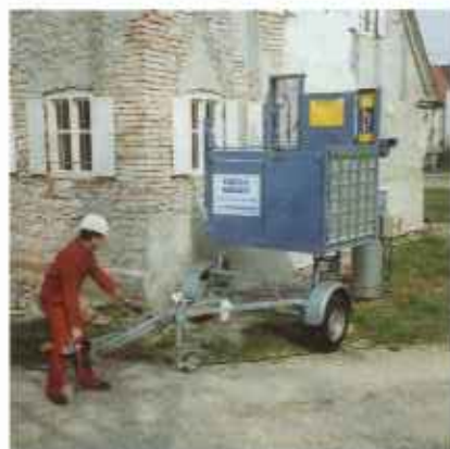
A trailer is available for road transport. The loading/unloading is effected by means of the drive unit of the transport platform.