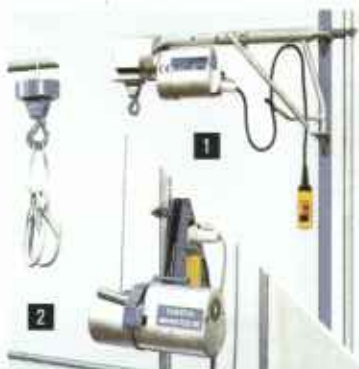
Rope hoists: ■ Swivel arm hoists ■ Scaffolding hoists