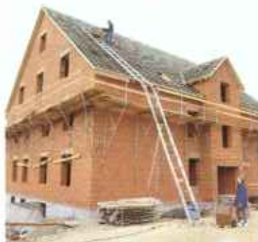
Inclined lifts with steel wire rope