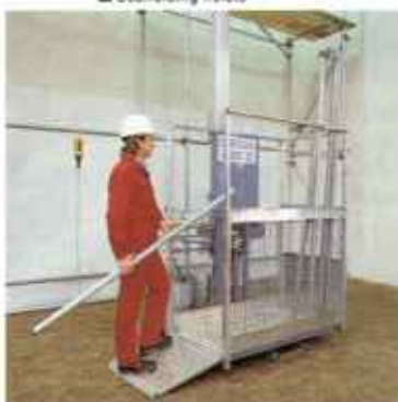
Rack and pinion hoists with aluminium mast