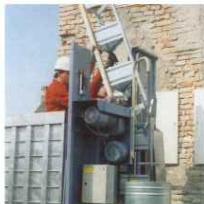
Assembly of the mast sections and anchoring of the mast is done from inside the load platform. The handy 1.5 m high steel mast sections with captive screws and nuts can be assembled very quickly without the need for a crane.