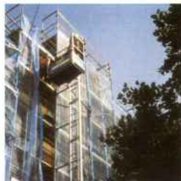
Inclined and vertical lifts with rack and pinion