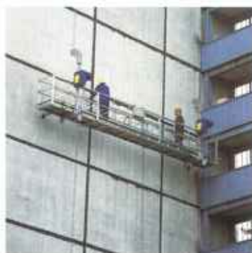
Suspended working platforms