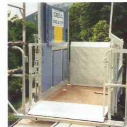
Hot-dip galvanised landing level safety gates (1 piece is supplied with the base unit) with mechanically locked sliding door are installed at the landing levels to ensure safety of people.