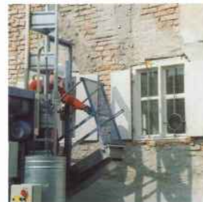
Assembly plank (can be retrofitted) for anchoring the transport platform without pre-built scaffold.