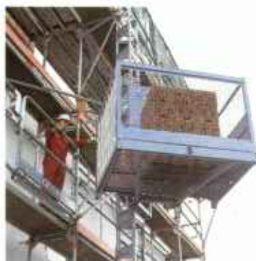
Rack and pinion hoists with steel mast