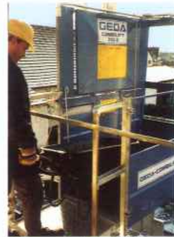
Safe access to the load platform, via integral platform and guardrail.