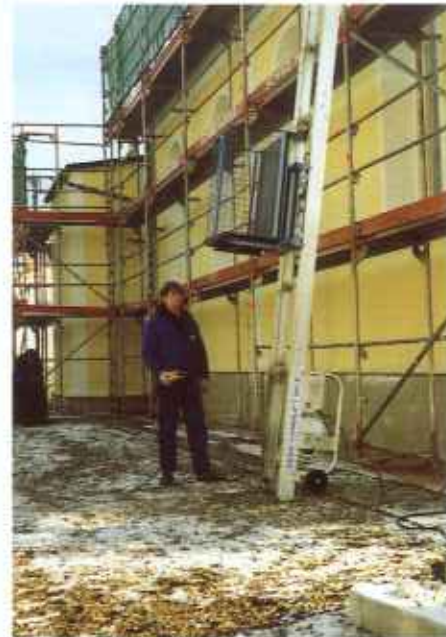
The GEDA-COMBILIFT 200 Z in inclined use with general purpose platform.