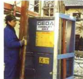
Load platform with support frame for scaffold tubes.