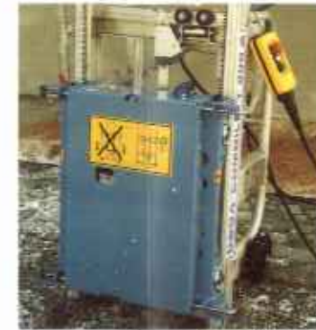
The compact base unit – suitable for both vertical and inclined use – consists of: