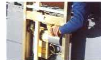
The ladder sections are connected by an integrated quick-lock that at the same time serves as limit stop and limit switch operating element.