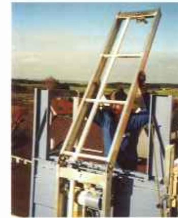
A patented bolt free connecting system, ensures easy assembly and disassembly.