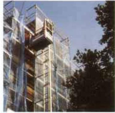
Inclined and vertical lifts with rack and pinion