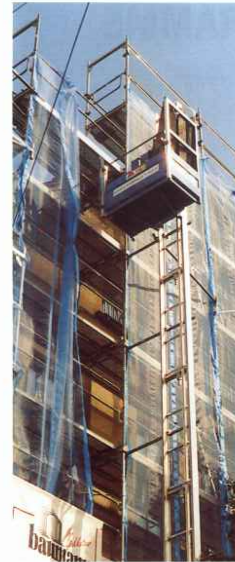
The GEDA-COMBILIFT 200 Z in vertical use with load platform.