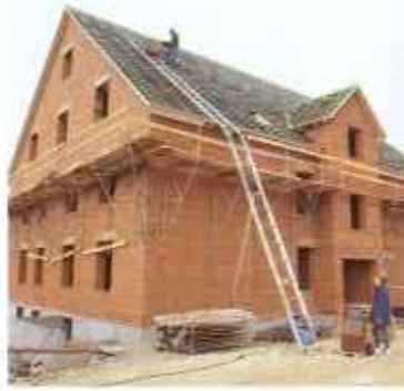
Inclined lifts with steel wire rope