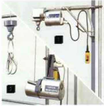
Rope hoists: ■ Swivel arm hoists ■ Scaffolding hoists