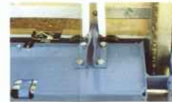
The trailing cable is automatically fed into the internal cable duct.