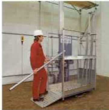
Rack and pinion hoists with aluminium mast