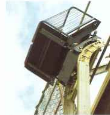
The angle track section (20°) can be extended by 10° segments to suit any angle.