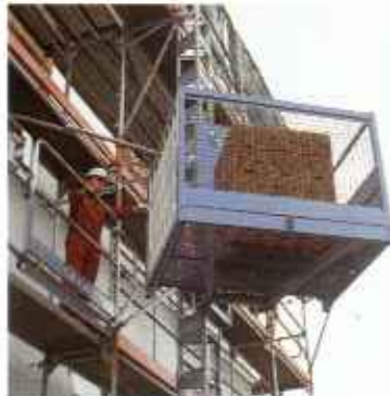
Rack and pinion hoists with steel mast