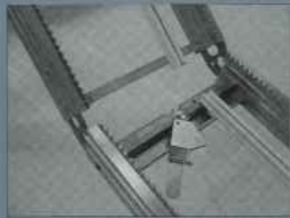
Ladder section with 200 and 250 kg payload respectively