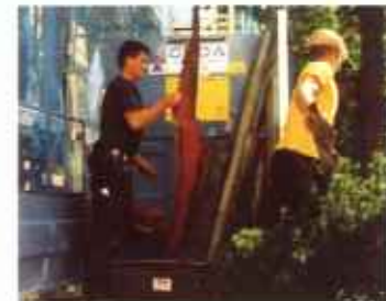
The front part can be opened completely, for easy loading/unloading of materials.