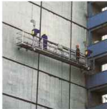
Suspended working platforms